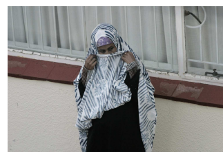
Mikhael Subotzky, Don't even think of it , 2012.